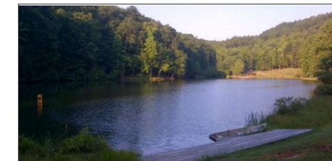
CBH's upper lake at dawn. This was taken just before the season-long rain storms began. A good time was had by all campers and staff alike during camp despite the wet conditions.

A large part of the credit for improving the facilities at CBH, and for getting the program areas ready for the new programs, goes to the brothers of Skyuka Lodge! Skyuka Lodge members spent many, many hours and weekends at CBH over the last year, and the results were amazing. From the Camp