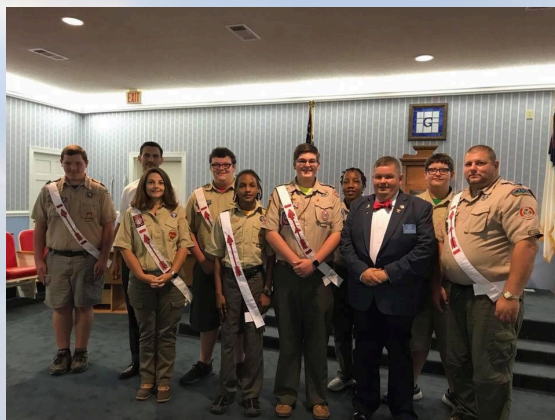
Members of the Chester Chapter presenting the Colors for the Annual 23rd Masonic District Inspirational Meeting.