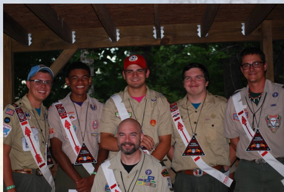
The 2017 Skyuka Lodge Vigil class following their tapout at the 2017 Summer Ordeal.